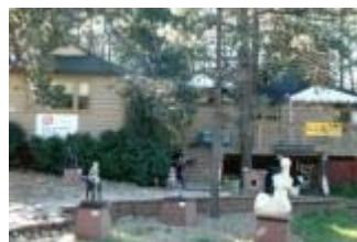
CAE Sculpture Garden

Evergreen Arts Center dba Center for the Arts in Evergreen opened in November of 2003 with the mission "To promote and cultivate artistic excellence and to enrich the art experience in our mountain community". The Center houses exhibit space, classrooms and meeting space utilized for art appreciation symposiums and art education. A dozen plus art exhibitions take place throughout the year, showcasing renowned and accomplished artists as well as aspiring artists. For upcoming events, shows and classes visit www.evergreenarts.org .